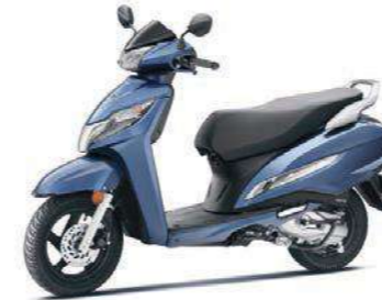
Midnight Blue Metallic