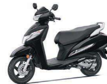
Pearl Night Star Black