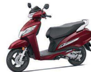
Rebel Red Metallic