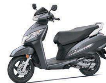
Heavy Grey Metallic