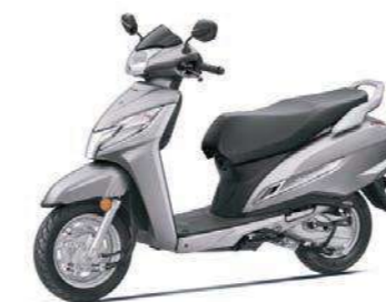
Strontium Silver Metallic#